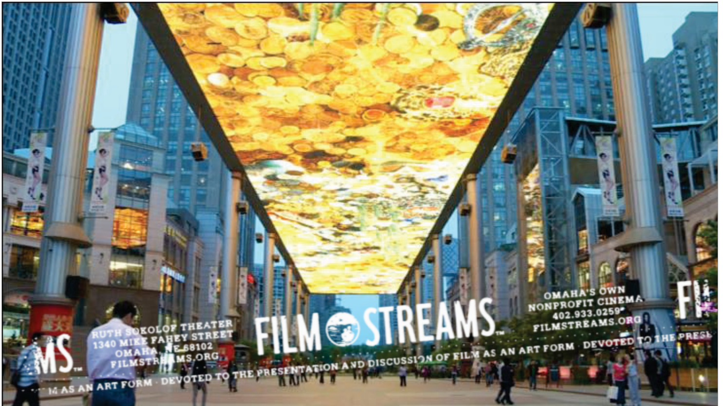
Beijing as seen in the new documentary URBANIZED