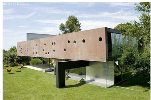
Top: CCTV Headquarters, Beijing. Below: Maison à Bordeaux, featured in KOOLHAAS HOUSELIFE.